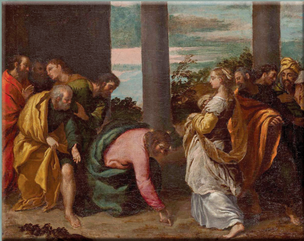
"Christ and the Woman Taken in Adultery" by Scarsellino, 1600-10

"While the world changes, the cross stands firm."