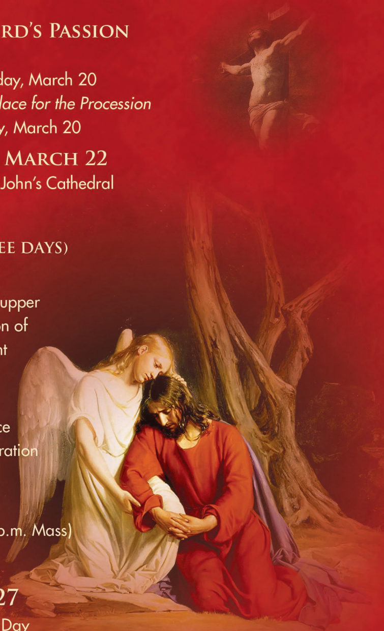
"Gethsemane" by Carl Bloch