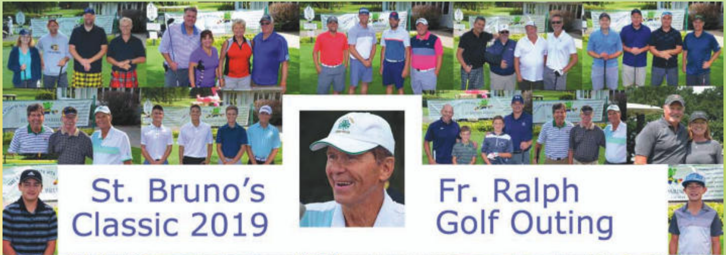
St. Bruno's Classic 2019

"While the world changes, the cross stands firm."