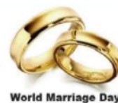
World Marriage Day

2020 WORLD MARRIAGE DAY will be celebrated on Sat., Feb. 8, at the 5 p.m. Mass. This Mass will include the Renewal of Marriage Vows. If you are celebrating a multiple-of-five anniversary in 2020 (married in a year ending in an 0 or a 5), you can request a certificate honoring this special milestone. To request your certificate, please visit www.stcatherine-austin.org/marriage-enrichment by Wed., Feb. 5.