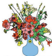
Flowers This Week