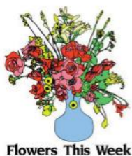
Flowers This Week

THE DAY OF THE DEAD (Día de los Muertos) PARISH ALTAR will be set up in the narthex from Sat., Oct. 17 until Sun., Nov. 22. Please bring a memento or photo of your loved ones to place on our altar. (Make sure to label the items with your name.)