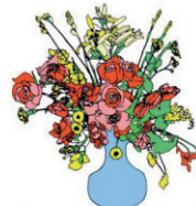
Flowers This Week