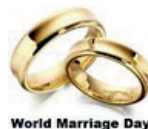
World Marriage Day