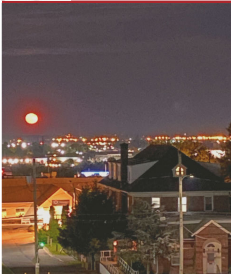
Moon rising over the original 1908 church

Parish Established 1908 • Church Dedicated 1947