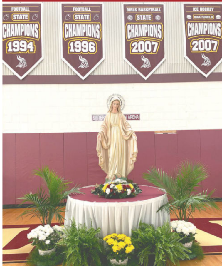
"Our Mother Mary" at Graduation

Parish Established 1908 • Church Dedicated 1947