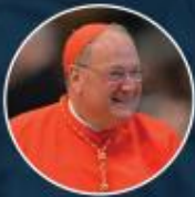
Mass with CARDINAL DOLAN Archbishop of New York

APRIL | 23 | 2022 • ST. JOSEPH'S SEMINARY