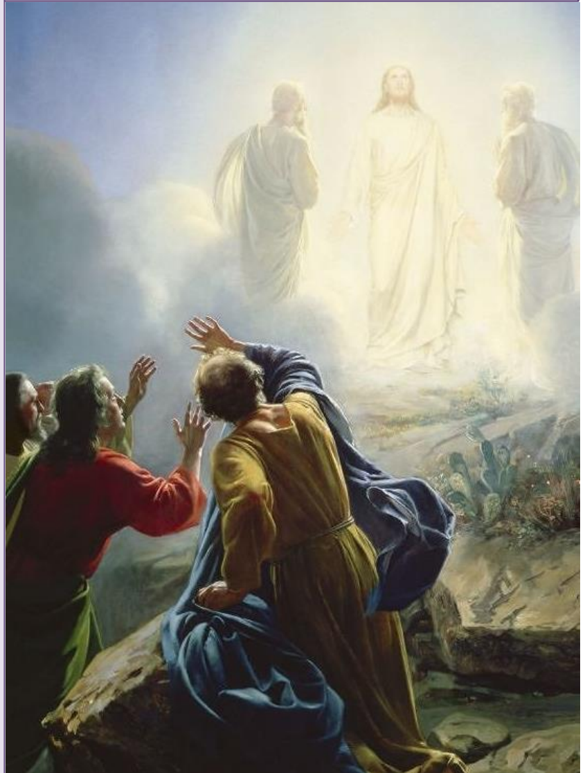
Transfiguration of Jesus Carl Bloch, 1872