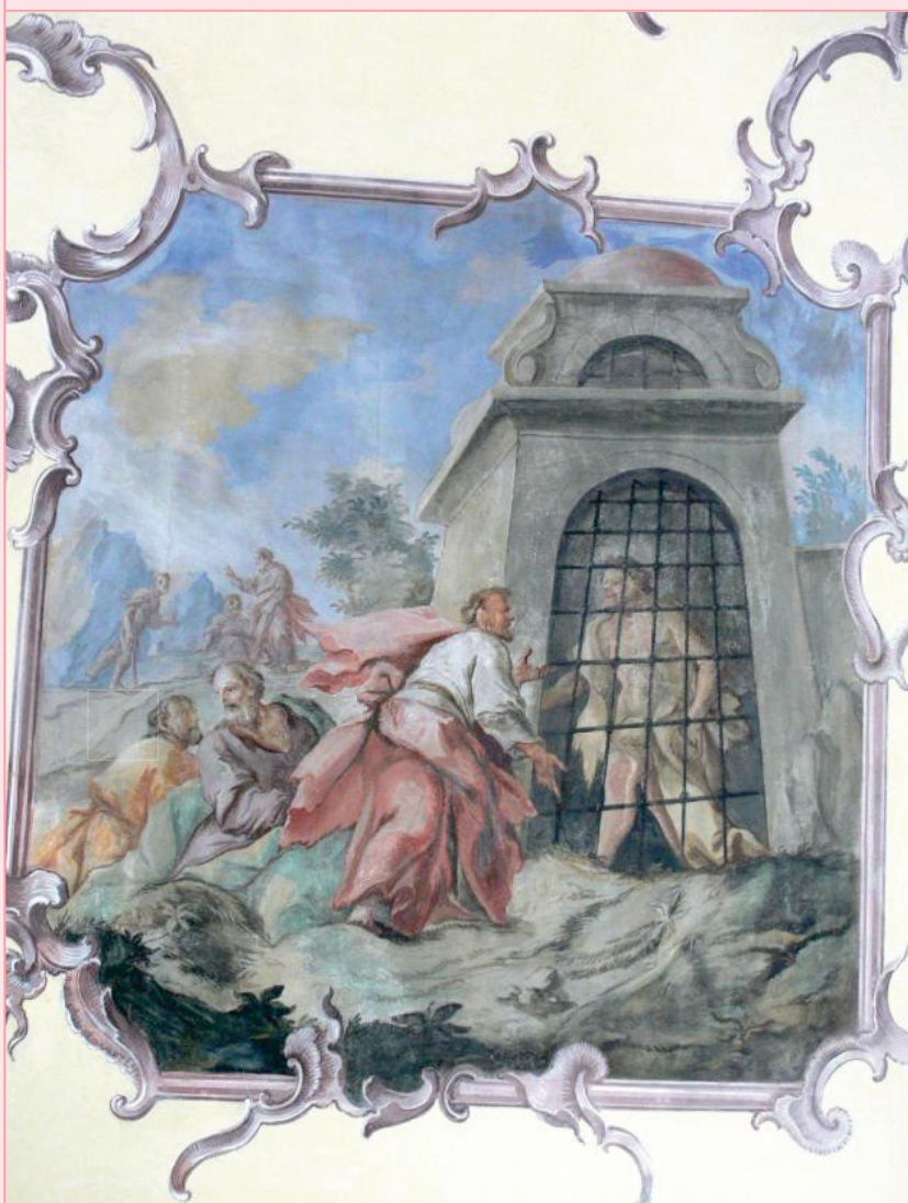
Oberzell, Taldorf district, city of Ravensburg - Church of Our Lady of Sorrows Ceiling painting in the nave: "John the Baptist in Prison" (with the disciples sent as messengers to Jesus) Josef Anton Hafner, c. 1750

The LORD God keeps faith forever, secures justice for the oppressed, gives food to the hungry. The LORD sets captives free.