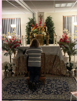
Our Altar of Repose