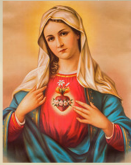
The month of May is dedicated to the Blessed Virgin Mary, Mother of God