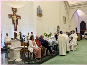
OCIA Feet Washing