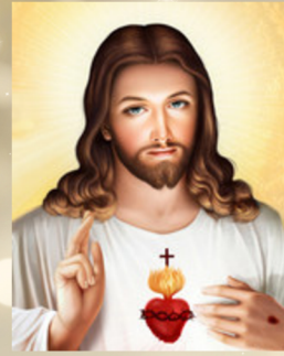
The month of June is dedicated to the Sacred Heart of Jesus