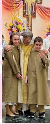
Congratulations to our newest members!