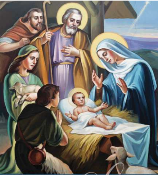
The Nativity of the Lord

I would like to take this opportunity to wish everyone a blessed Christmas season as we prepare to celebrate this coming week. Thanks to all who attended our reconciliation service and many other celebrations of our parish and school during the Advent season. It takes many hands to bring everything together and I want to thank each and every one of you who helped in any way. Thank you for your great generosity to all of our Christmas outreach programs and to those who helped to organize them. A special thanks to our staff and deacons who have worked extra hard on all the additional responsibilities during this season. Finally, thank you to all who have sent me cards, family photos, gifts and food. I hope to get individual thank you notes out, if possible after Christmas; but in the mean time, know that I am most grateful to everyone. I hope that you are able to join us for our Christmas and New Year's services.