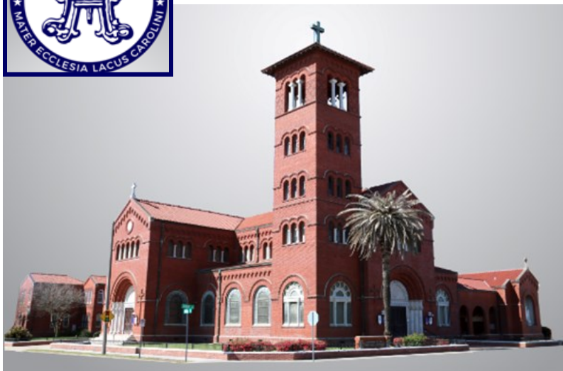
IMMACULATE CONCEPTION CATHEDRAL PARISH Established December 8, 1869