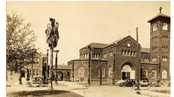
After ~ 1913 ~