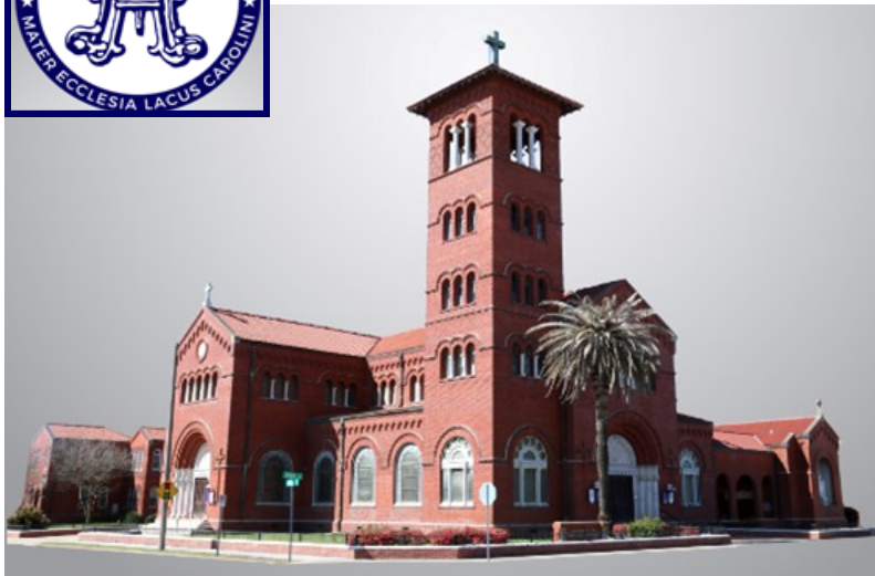
IMMACULATE CONCEPTION CATHEDRAL PARISH Established December 8, 1869

DIOCESE OF LAKE CHARLES Established April 25, 1980