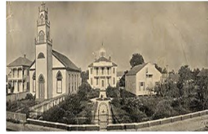
Before the Great Fire ~ 1910 ~

You may also enjoy looking at historic pictures and artifacts!