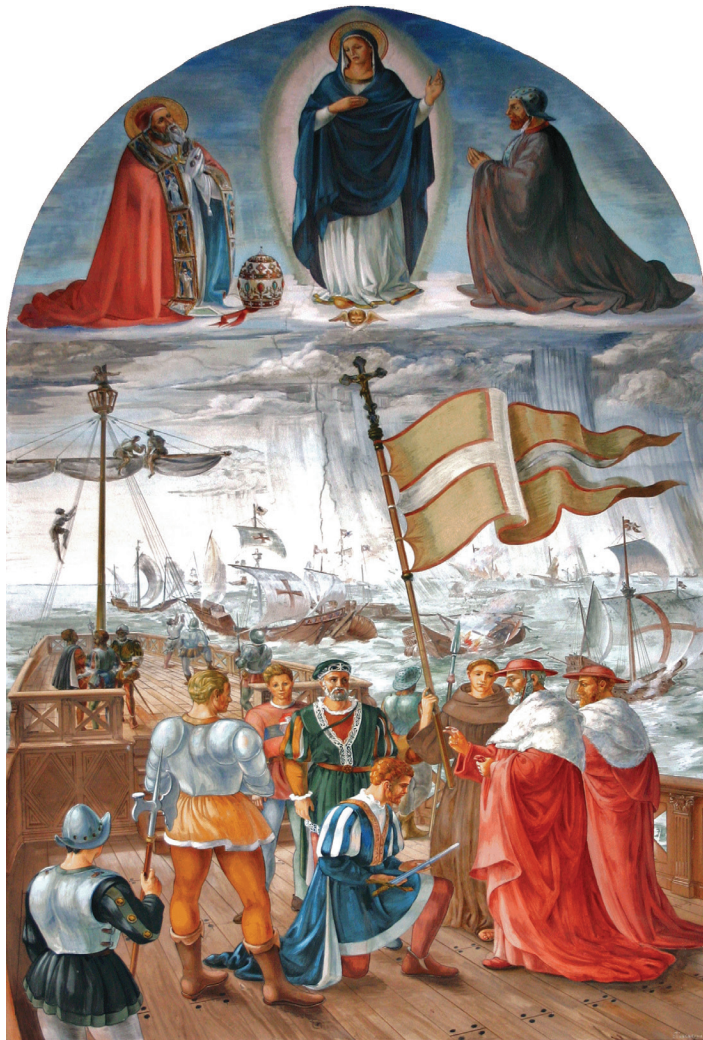
Battle of Lepanto in 1571 Don Juan of Austria and Cardinals Franciscan Church of the Visitation Ain Karim Israel

Mondays and First Fridays after the 12:00 PM Mass at Immaculate Conception Reposition and Benediction is at 7:00 PM