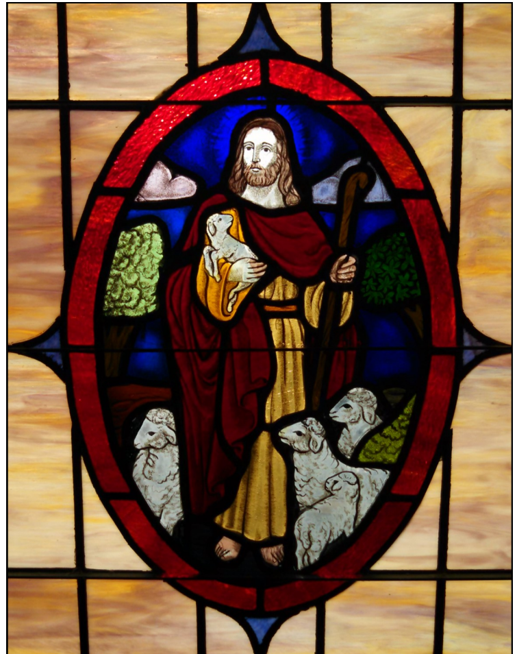
Stained glass window from West Monroe Baptist Church, NC

4:00-5:00 PM at Immaculate Conception and anytime by calling the priest on duty: (914) 961-3643.