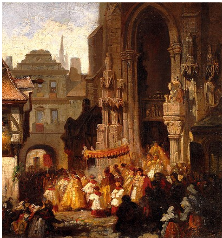
The Procession for the Feast of Corpus Christi

Cemetery: 8:00 AM - 4:00 PM ..... Daily Visitation