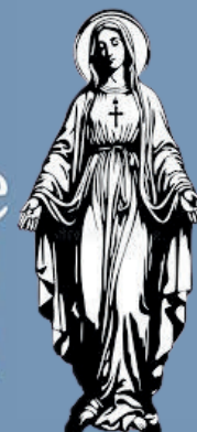
SEASON TWO TEN VIRTUES of MARY

EVERY MONDAY Morning sessions at 9:15AM or Evening sessions at 6:00PM