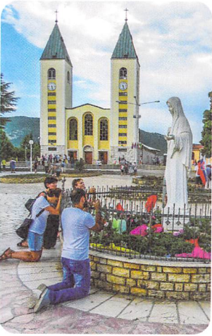
PRAYING IN FRONT OF THE STATUE OF OUR LADY MARY MEDJUGORJE, BOSNIA AND HERZEGOVINA