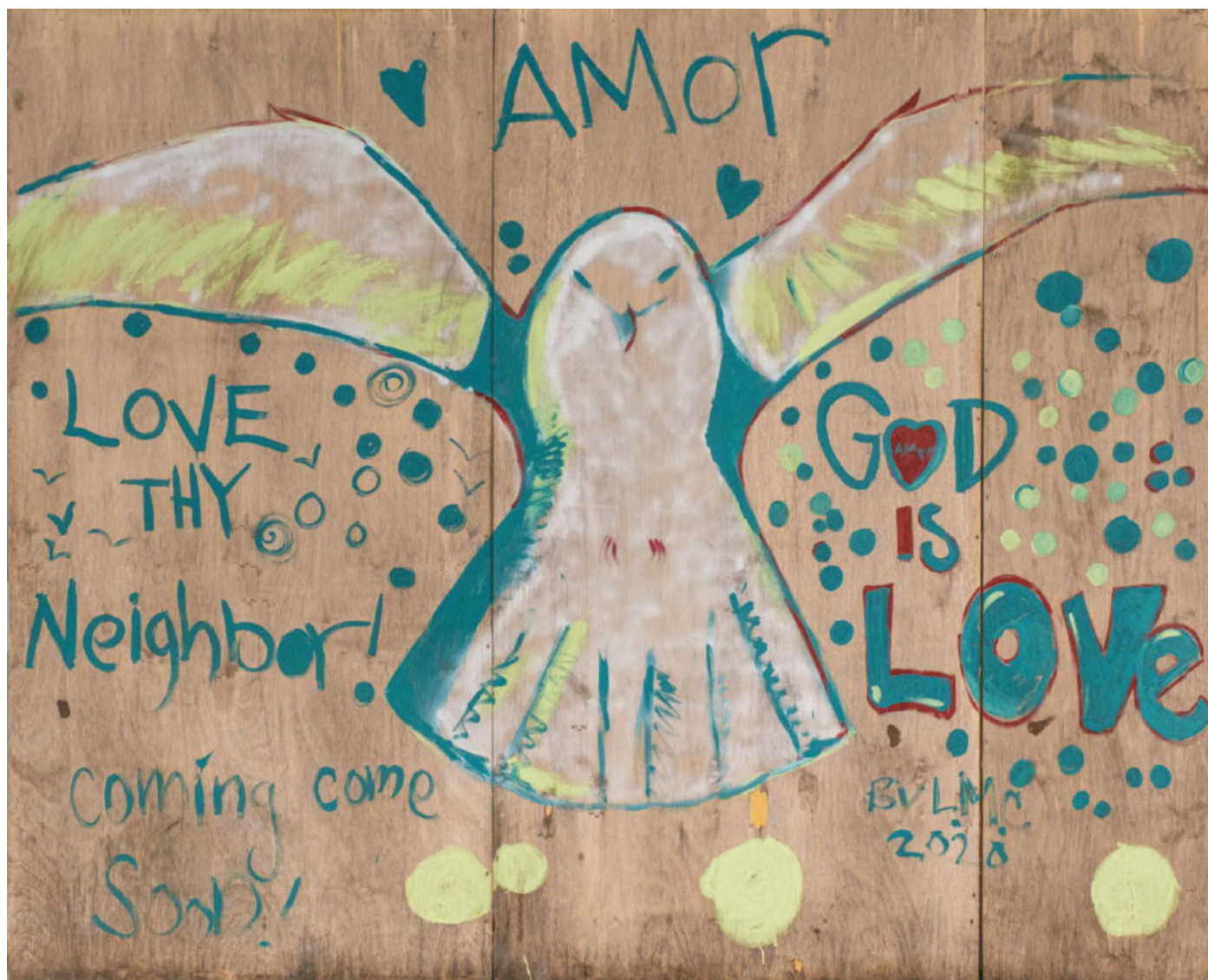
Amor, 2020 Collective of Dyckman Muralists.