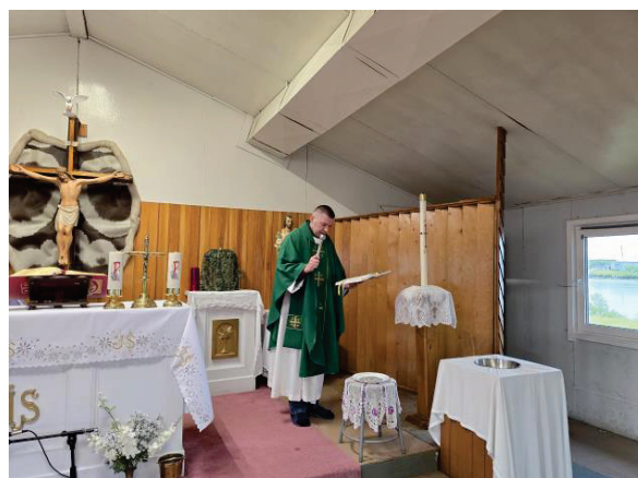
Father blesses the Medals at Mass