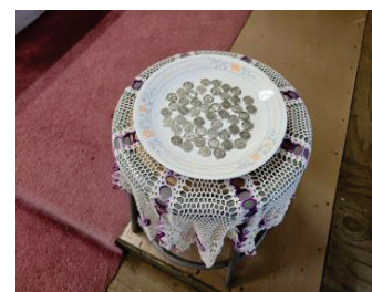
The St. Benedict medals we sent to Father