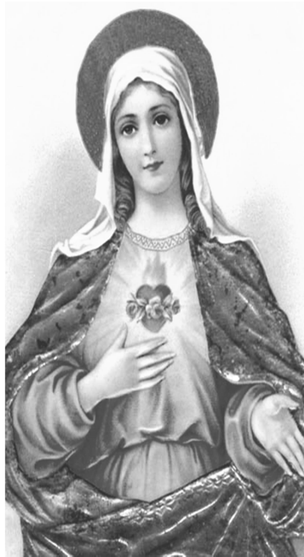
St. Francis of Assisi Church Mildred, PA