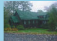
St. Francis of Assisi Chapel Eagles Mere, PA