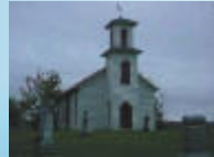
St. John Neumann Shrine Sugar Ridge, PA