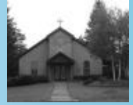
St. Francis of Assisi Church Mildred, PA