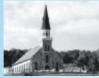
St. Basil the Great Church Dushore, PA