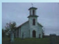
St. John Neumann Shrine Sugar Ridge, PA