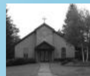
St. Francis of Assisi Church Mildred, PA