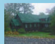
St. Francis of Assisi Chapel Eagles Mere, PA