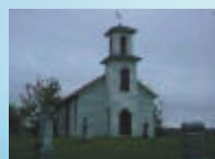
St. John Neumann Shrine Sugar Ridge, PA