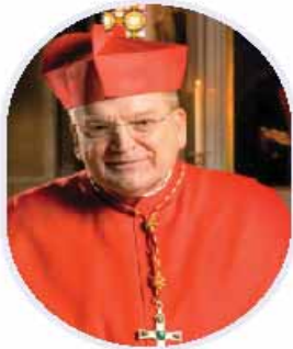
Champion of Life Award Recipient Raymond Leo Cardinal Burke

St. Charles Convention Center | St. Charles, MO Social Hour 6 p.m. ~ Dinner & Program 7 p.m.