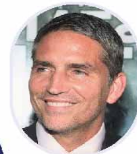
Featured Speaker Actor Jim Caviezel

Register online at MRLBanquet.com by August 31st