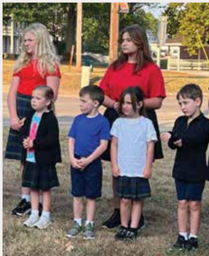
Students participated in a September 11 Memorial at the flagpole.