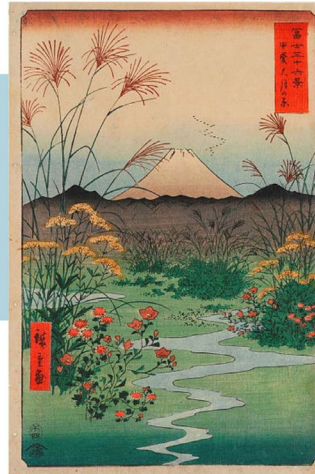
art by Utagawa Hiroshige (1797-1858)