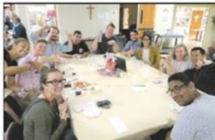
THUMBS UP FOR ALPHA At a small group meeting at Notre Dame of Mount Carmel Parish in Cedar Knolls, young adults give thumbs up to the parish's Alpha experience. Alpha is an 11-week series of weekly sessions, each one featuring a meal, video, and small group discussion, that has become a powerful tool for evangelization for the parish.

Alpha in one of the early in-person series, offered these insights about the program: "Alpha is an evangelizing tool that introduces people to a transforming relationship with Jesus Christ. I see it as a huge blessing to our parish because it also allows the development of leaders who become engaged disciples giving generously of their gifts. Alpha is not just a 'here and now moment,' but rather, does something to the heart that recalls the famous words of St. Augustine: 'My heart is restless until it rests in Thee.' Mysteriously and blessedly, Alpha makes restless hearts rest in the peace of Christ."