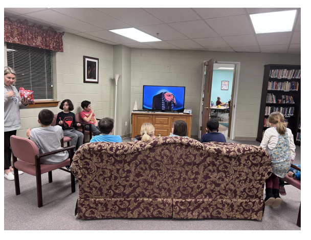
Click here to view more!