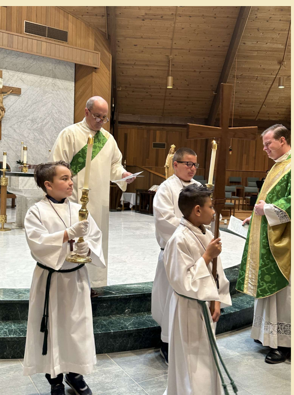
Special thanks to our Scouts and their leaders for their witness and contributions to our families, parish, and community!