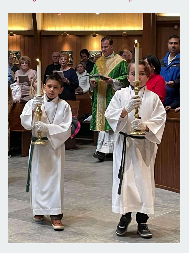
Family Mass - Scouts Sunday