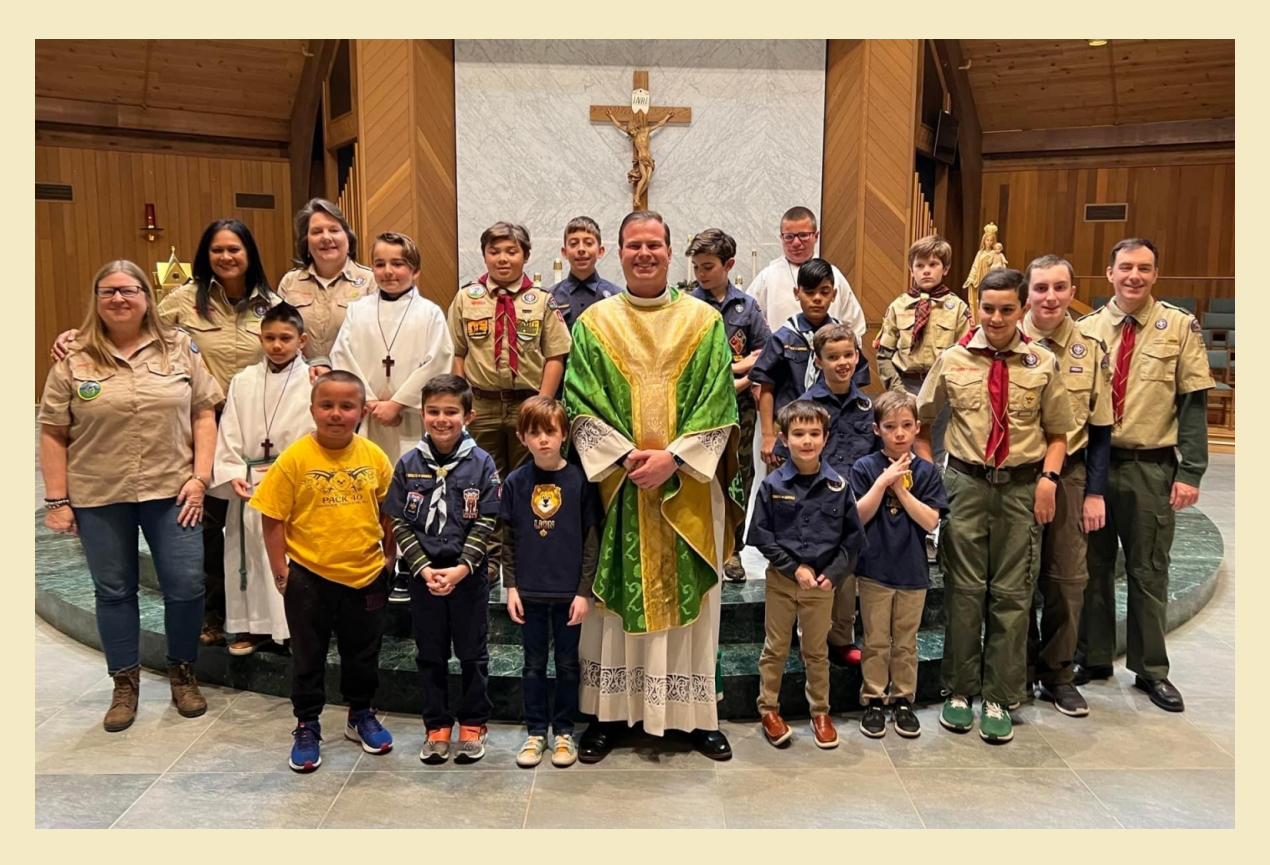
"A Scout is trustworthy, loyal, helpful, friendly, courteous, kind, obedient, cheerful, thrifty, brave, clean, and reverent."

The Scout Sunday tradition was started to make people in houses of worship aware of Scouting and to allow Scouts to live out their "Duty to God" pledged each week.