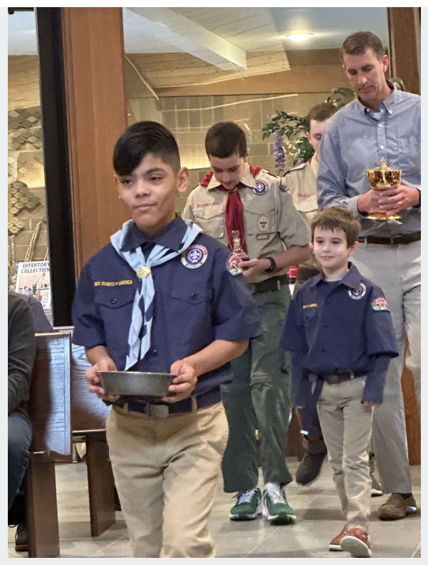
Click HERE for more memories!