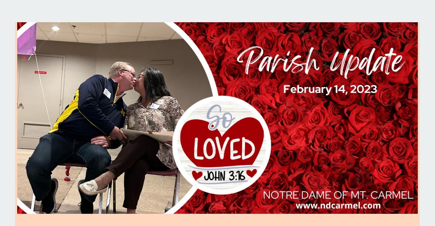
Not-So Newlywed Game

Subject: Parish Update: February 14, 2023