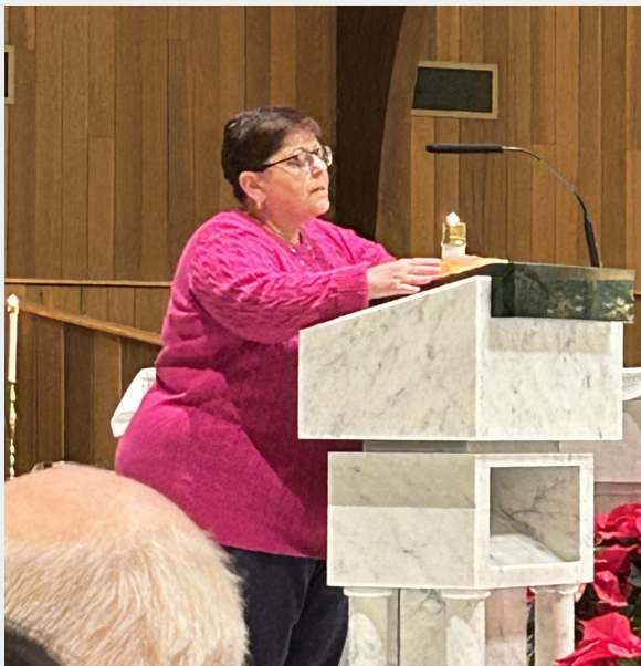
5 pm Mass