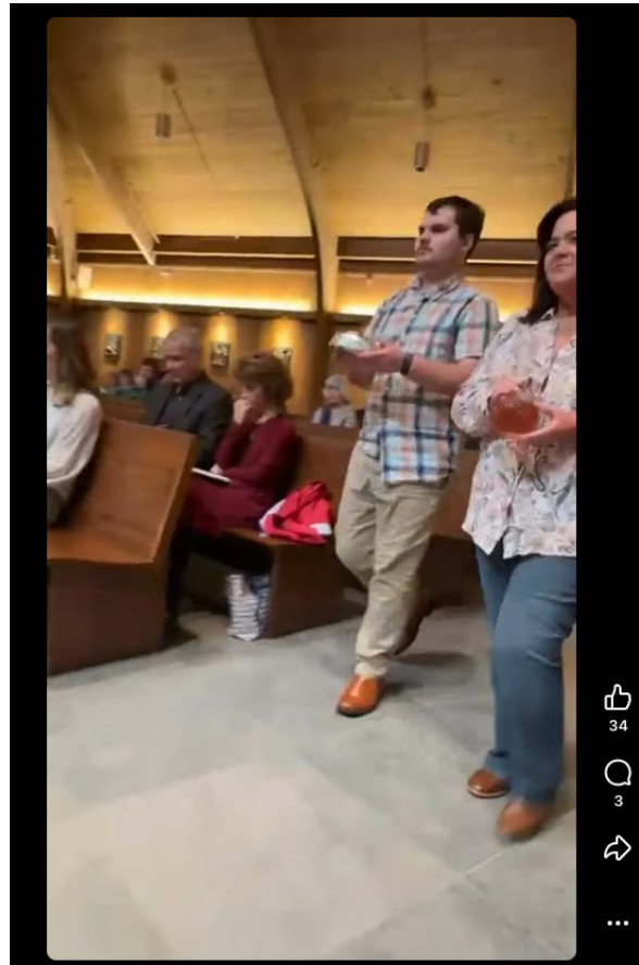
9:30 am Mass (click below)