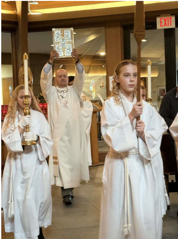
7:30 am Mass (click below)