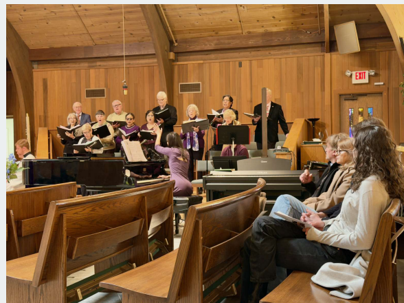
6 pm Mass