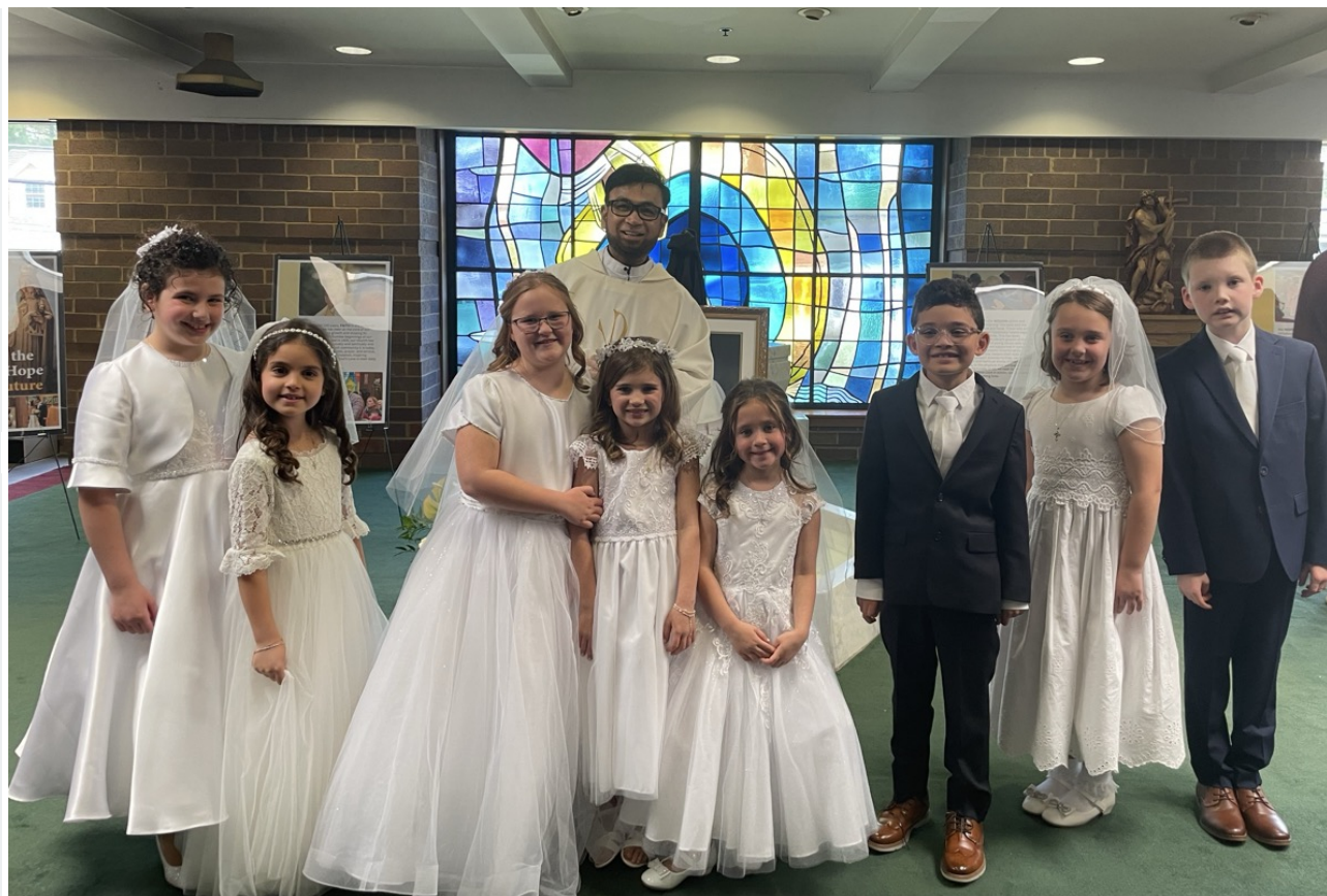
Divine Mercy Prayer Service (click to view our reel on social media)