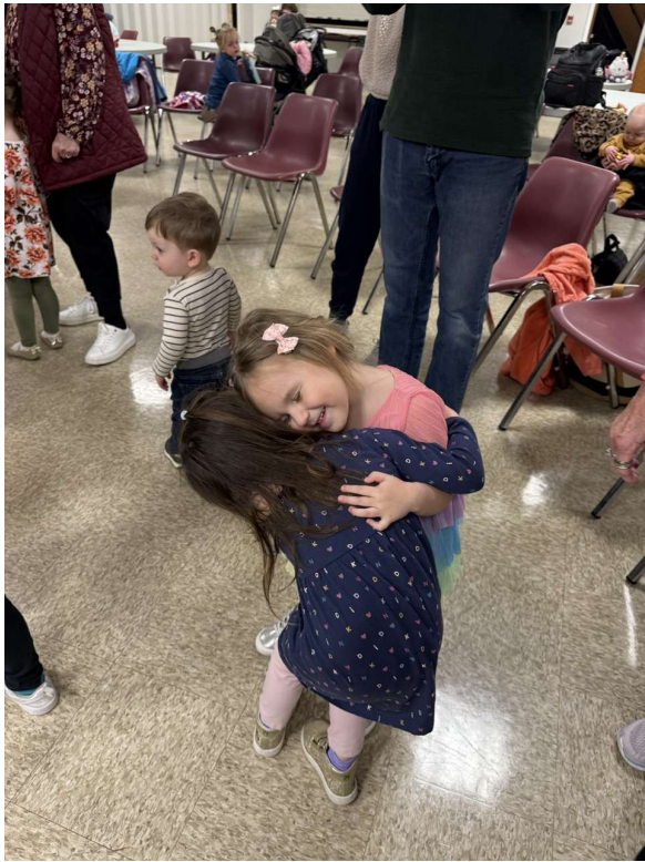
5 pm Mass