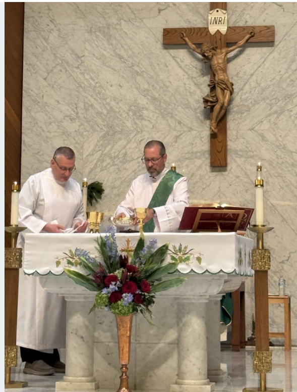
9:30 am Mass