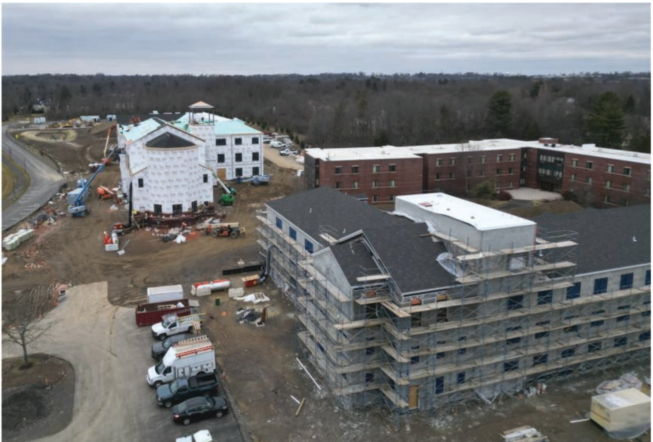
Most recent photo of the construction of the Seminary buildings on the new Lower Gwynedd campus

If you have not yet contributed to this year's Appeal and wish to do so, or would like to add to your previous donation, please go to www.stcharlesseminaryappeal.org/resources . Donations also can be made via U.S. mail to : The Catholic Foundation of Greater Philadelphia, CL#5315, P.O. Box 95000, Philadelphia, PA 19195-0001. Thanks so much for supporting this treasured institution, and its valuable programs of formation and education for seminarians, candidates for the permanent diaconate, and laypersons seeking theological and pastoral degrees!