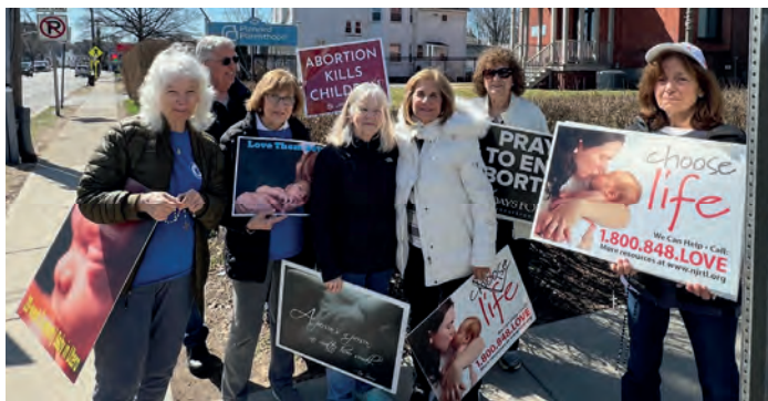
Rosary for the Unborn, Respect Life Ministry