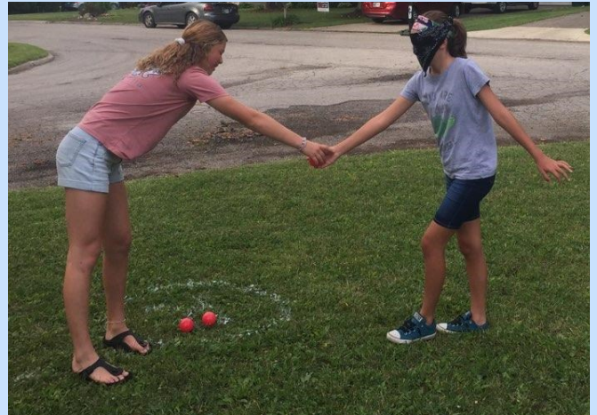
Junior High Youth Group game from Mon, June 29th.