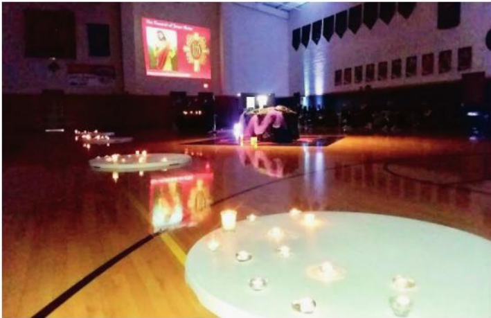
10th grade Lenten Service in Chuck Mosey