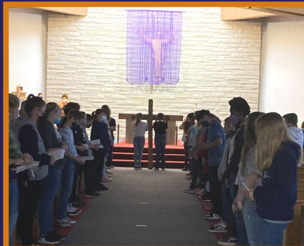
The 6th grade class leads praying the Way of the Cross.