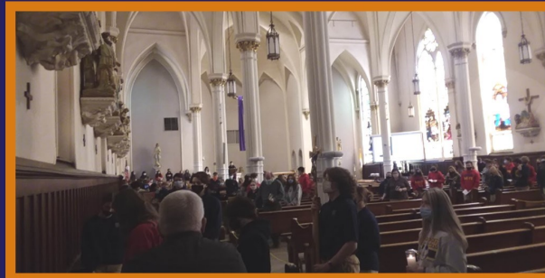
The 9th grade class leads praying the Way of the Cross.