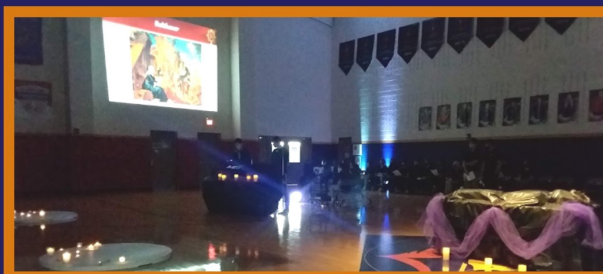
The 10th grade class leads the school in a ‘Funeral of Jesus’ which was a reflection the meaning of Jesus’ death, and resurrection.