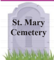
St. Mary Cemetery

Spring cleanup will take place after March 15th at St. Mary Cemetery. If you have wreaths, flowers or any decorations you would like to keep, please remove them by Friday, March 15, 2024. Otherwise they will be disposed of. Thank you.