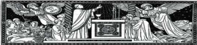
Commemoration of All The Faithful Departed (All Souls)

The Feast of All Souls Novena is a special day to remember our departed loved ones and all those in Purgatory and to celebrate our hope of eternal life. This hope is made real for us in Christ's death and resurrection. On All Souls' Day, the Church invites us to pray for our beloved deceased. It is not a day to mourn, but rather a day to reflect on the passion of Jesus Christ and give thanks for His gift of Abundant, Eternal Life! If you would like your loved ones remembered in a Novena of Masses, which is nine consecutive Masses, pick up a Novena envelope in the Narthex or Parish office and fill out your envelope and return it to the Parish office or place it in the collection basket.