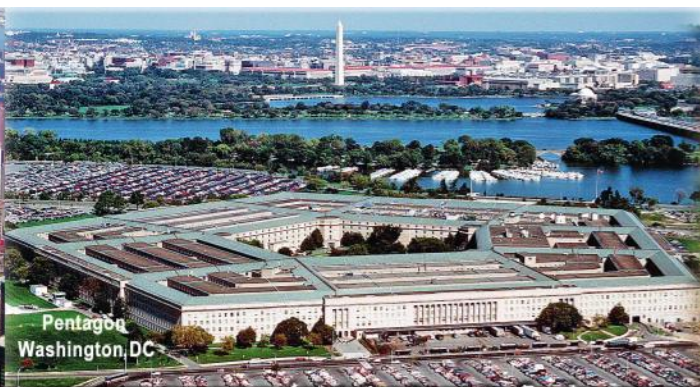
Pentagon Washington, DC