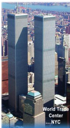
World Trade Center NYC