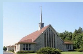
ST. MARY Catholic Church

600 Saint Mary's Avenue Frankfort, Indiana 46041 765-654-5796