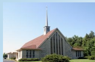
ST. MARY Catholic Church

Congratulations on the newest member of your family! Parents wishing to have their child baptized are asked to contact the Parish Office to make an appointment for pre-baptismal instruction.