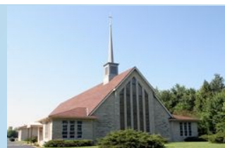
ST. MARY Catholic Church

Congratulations on the newest member of your family! Parents wishing to have their child baptized are asked to contact the Parish Office to make an appointment for pre-baptismal instruction.