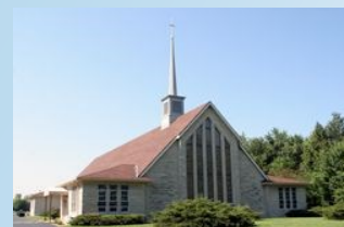
ST. MARY Catholic Church

Congratulations on the newest member of your family! Parents wishing to have their child baptized are asked to contact the Parish Office to make an appointment for pre-baptismal instruction.