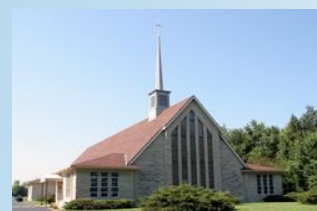
ST. MARY Catholic Church

Congratulations on the newest member of your family! Parents wishing to have their child baptized are asked to contact the Parish Office to make an appointment for pre-baptismal instruction.